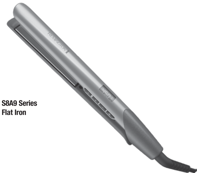
S8A9 Series Flat Iron